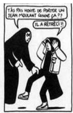
Figure 5: Persepolis, p.132)

On the contrary the harsh laws imposed by the Islamic Revolution put an end to all her independence and movement. The arrest and the execution of eighteen-year old Nilofaur is another vibrant example for the brutality and the violence of the regime.