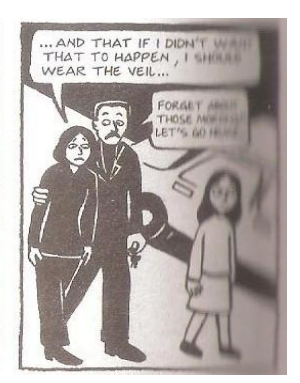
Figure 2: Persepolis, p.74

In the Persepolis , one of the religious fundamentalists declares, "Women's hair emanates rays that excite men. That's why women should cover their hair! If in fact it is really more civilized to go without veil, then animals are more civilized than we are" ( Persepolis , p.74). On the whole, the perception regarding the concept of "veil" is synonymous with the repression of women under the guise of cultural and religious identity.